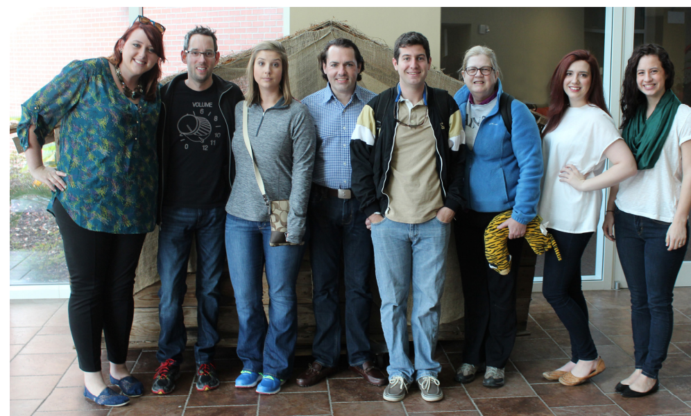
Eight of our members left Thursday for a week of medical missions in Haiti. They will be joined by ten members of First Baptist Covington. Remember to pray for them this week.